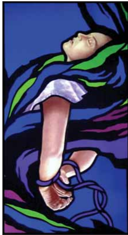
“The Ecstasy of St. Joan” Butler Fine Art Glass This 72" x 32" panel is fabricated from Lamberts glass and painted with Reusché paints. It also fea- tures an aluminum overlay that increases and enhances the nega- tive space in the window’s design.

Parish Building Projects,” “Visio Divina,” “Renovation Projects,” “Natural Lighting of Churches,” “The Aesthetic Language of Religious Space,” “Church Architecture: Using All Your Senses,” “Principles of Art and Architecture,” “What Does a Liturgical Design Consultant Do?,” “Digital Tools for Improving Collaboration and Fundraising on Church Building Projects,” and “A Look at the Impact of Documents and Instructions.”