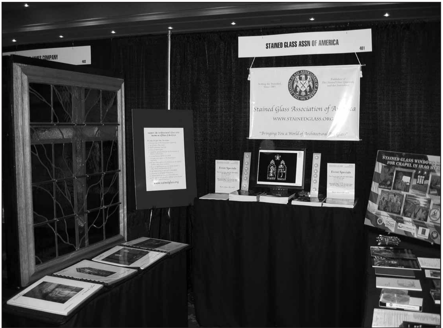
The SGAA booth at Form/Reform 2006.

and usable, starting with a redesign of Accredited Studios' Portfolio Presentation Pages and the opening of the publication to the Association's new Accredited Active members.